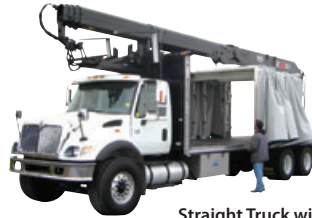
Straight Truck with Crane